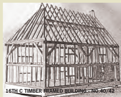
16TH C TIMBER FRAMED BUILDING - NO.40/42

Cross over and pause outside No 40/42. This is a very fine example of a 16th century timber framed building which still has partitions of wattle and daub in the attic. Most probably this cottage was used by framework knitters in the late 18th century. As you continue walking down the street, note how attractively many of the former farms and cottages have been converted and renovated. Several buildings have Georgian fronts, like Westhorpe House No 54. The Westhorpe Estate is still a working farm. Walk as far as Westhorpe Hall, on your right, behind fine old walls - you can catch a view in a gap further along.