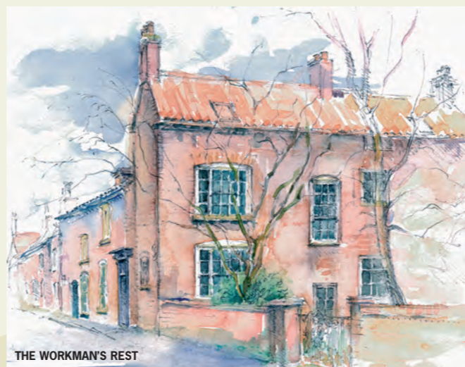
THE WORKMAN'S REST