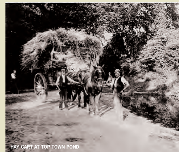
HAY CART AT TOP TOWN POND

Pinfold's strayed stock. Opposite to you on a slight hill is the former cottage of the Pinder who looked after the Pinfold, which lies to the ground below the cottage. A Pinfold is the place where animals that had strayed would be impounded and could only be reclaimed by the owner on payment of a penalty. At the side of