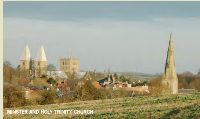
MINSTER AND HOLY TRINITY CHURCH

Cross the bridge over the Dumble and walk for some distance up Cundy Hill as far as a FP on your left. Take the FP and walk as far as another FP on your left, turn left and walk downhill towards the Dumble. Enjoy the superb view of Westhorpe and Norwood Park beyond. To your right is a wonderful view of the Minster and Holy Trinity Church.