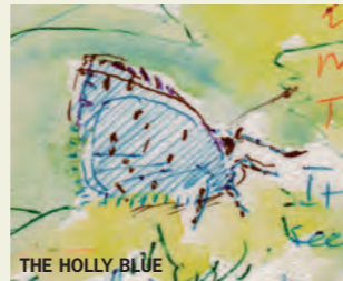
THE HOLLY BLUE

WESTHORPE DUMBLE. A dumble is a stream which has formed a deep wide channel in the clay that is quite out of proportion to the amount of water normally carried. It is also heavily wooded and makes a strong boundary feature. In the shade of the Dumble grow violets, primrose, wood anemone, sanicle and enchanter's nightshade. Blackthorn blooms in profusion in early Spring and there are many fine trees such as oak, beech and ash along the course of the Dumble. The toad, frog and newt are still common place in the gardens and ponds of