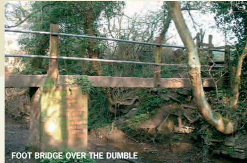
FOOT BRIDGE OVER THE DUMBLE

Go across the Dumble bridge and enter the ridge and furrow meadow. In May and June it is full of wild flowers - meadow buttercup, pignut, cuckoo flower, clover, speedwell, birds-foot-trefoil, knapweed and lady's mantle. The hawthorn hedges are full of May blossom and the hedgerows